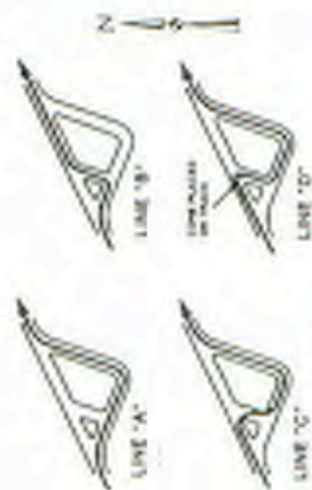
TIMES SQUARE VARIATIONS