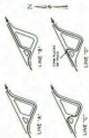
TIMES SQUARE VARIATIONS