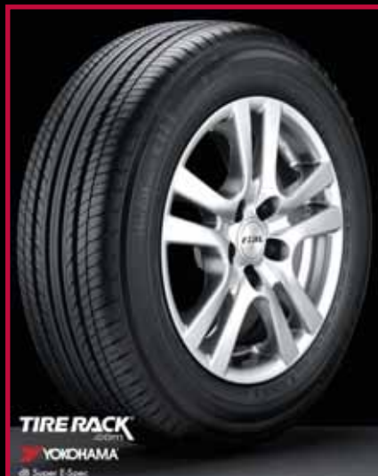
TIRE RACK YOKOHAMA dB Super E-Spec

Getting Green: Green Earth Technologies (GET) has an environmentally friendly oil that became the official motor oil of the American Le Mans Series and International Motor Sports Association (IMSA). G-Oil is an