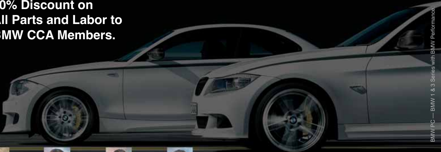
BMW PC — BMW 1 & 3 Series with BMW Performance.

10% Discount on All Parts and Labor to BMW CCA Members.