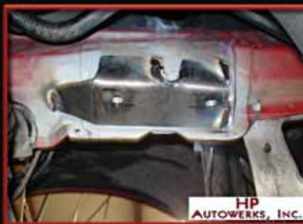
REPAIRED FRAME RAIL

A consideration when upgrading your sway bar is the effect it will have on the mounting points of the frame rail. Recently there has been a lot of discussion about frame rail failure due to the added stress from aftermarket swaybars. Often associated with retaining OEM springs rather than upgrading to a high performance springs, the failure can cause your strut bar to fall away from the bottom of the car, potentially endangering you during a high performance driving event or race.