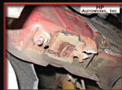
TORN FRAME RAIL

With the soft front springs, big front sway bars, and additional rebound, the front end is now doing its part. Big rear springs pitch in to keep the rear spoiler up in the wind for more exit grip and forward bite. Added right rear spring rate holds up the right rear corner helping to keep the left front low promoting more air flow over the body for more overall down force. The big bar soft spring set-up gets the front and rear to work together for maximum aero balance and grip.